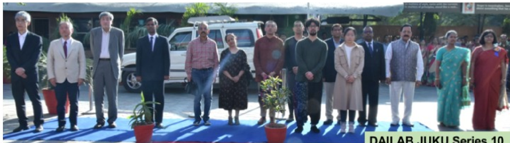
DAILAB JUKU Series 10