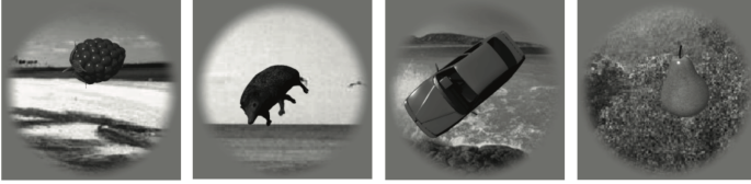
Fig. 1. (Reproduced from [8].) Samples from the dataset introduced by [8].

Given these representations, we can compute the representational dissimilarity matrix \mathbf{R}_N as ([8])